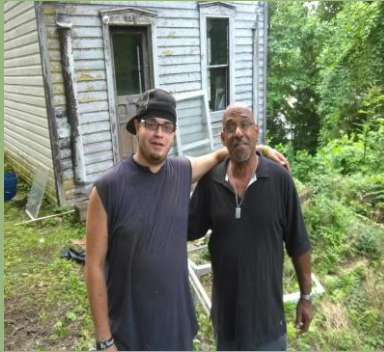
Beacon of Hope

Beacon of Hope is a building that is being rebuilt and designed to be a community outreach center in Franklin, Pa. This past summer Marsha and I were able through your offerings to go back and complete the final stage of cleaning out the home, connecting the water pipes, making repairs to the roof and make preparations to paint and install a functioning bathroom. We were also able to purchase the double lots behind