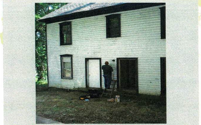
Beacon of Hope, Franklin, Pennsylvania