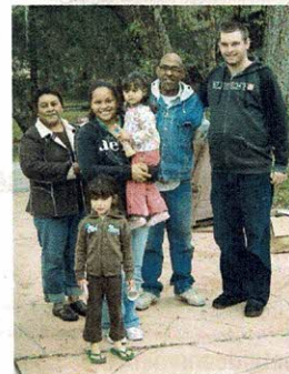
Family taking toys to Mexico for Christmas.

FOR MORE INFORMATION, ABOUT EVENTS LISTED PLEASE CALL 407-973-2660 OR VISIT OUR WEB SITE STREETGIDEONMINISTRIES.COM