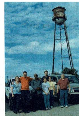
Christmas outreach to the Lachoochee, Fl. neighborhood, with our friends and pastors from TEAMS Int. Church