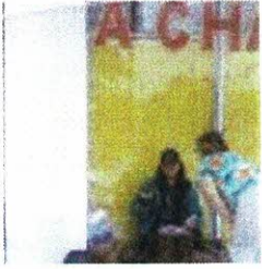
"Outreach to the Ladies"